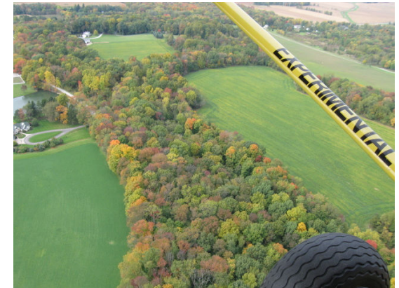
Fall Colors 2009!

Election News Coverage—“Catch all the exciting election coverage as it happens.” OK, maybe not all that exciting, but it is time for the NCLF Elections. Attend the last meeting of the year, make your voice heard, and enjoy good friends and good food! A BIG THANKS to our officers for the work they have done this past year!